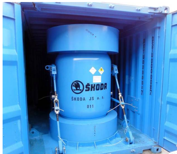
Fig. 2. The SKODA VPVR/M cask within the ISO container

Using only one type of cask for such a large-scale program of the fuel return to the Russian Federation was obviously insufficient. The DOE devoted special funds for development and fabrication of sixteen SKODA VPVR/M casks within the framework of the program. The Czech SKODA VPVR/M cask was initially more adapted for use in multimodal shipments, as it was installed within 20-foot freight ISO container (Fig. 2), the handling of which was unified for practically all conveyances.