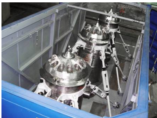
Fig. 8. An overpack made on the basis of the freight ISO container for transport of the TUK-19

The RR SNF was removed from Romania in June, 2009. The TUK-19 casks, loaded with SFAs and packaged into the ISO containers, were delivered by road to a Romanian airport. The Volga-Dnepr Airlines' AN-124-100 aircraft was used for this air shipment (Fig. 9). The flight route lied over the Black Sea to exclude crossing the airspace of third countries; when it lied over the land, it passed around large populated localities and hazardous industrial facilities. After an interim refueling stop in Ulyanovsk, the aircraft successfully landed at the Koltsovo airport, from where the consignment was delivered to Mayak PA by road.