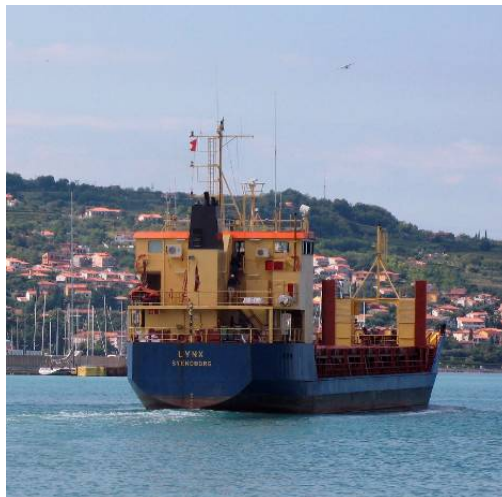
Fig. 5. The Danish LYNX vessel used to remove the RR SNF from Hungary

In 2008, the Czech SKODA VPVR/M casks were used to remove the RR SNF from the Institute of Nuclear Research of the Hungarian Academy of Sciences. It was the first time a sea shipment was carried out within the framework of the RRRFR program. In some projects, a sea shipment of SNF is the only possible way due to transit-associated complications.