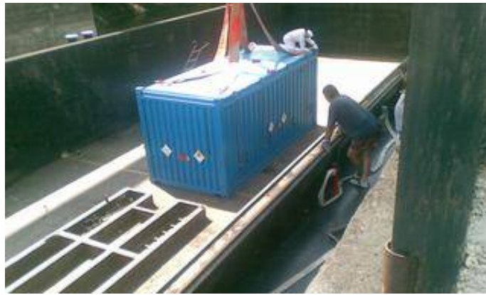
Fig. 4. Loading the ISO containers with the SKODA VPVR/M casks onto the barge of a sea-and-river type

In 2008, the Czech SKODA VPVR/M casks were used to remove the RR SNF from the Institute of Nuclear Research of the Hungarian Academy of Sciences. It was the first time a sea shipment was carried out within the framework of the RRRFR program. In some projects, a sea shipment of SNF is the only possible way due to transit-associated complications.