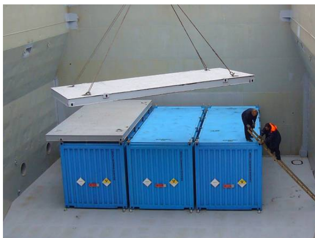
Fig. 11. Loading the ISO containers with the SKODA VPVR/M casks inside into the hold of the MCL-Trader vessel

After development and approval of the design the vessel was re-fitted at the Estonian Netaman Oy shipyard under the supervision of the local representatives of the Russian Maritime Register and certified as the one of INF-2 class. Many efforts were made to develop and approve all necessary vessel documents; the crew received appropriate training and permits for work. The vessel was refitted in compliance with all standards, has a big displacement, allows for loading packages with deck cranes, fitted for navigating in arctic seas and, consequently, has a higher safety level. The MCL-Trader vessel was first used in September 2009 for an RRRFR shipment to transport the SNF from the Ewa and Maria reactors, Poland (Fig. 11).